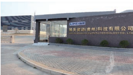
Ximei Guizhou: Tantalum metal production capacity of 200 tons and niobium metal production capacity of 1,000 tons