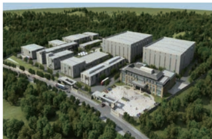
Hunan CNNC: Oxide production capacity of 1,000 tons