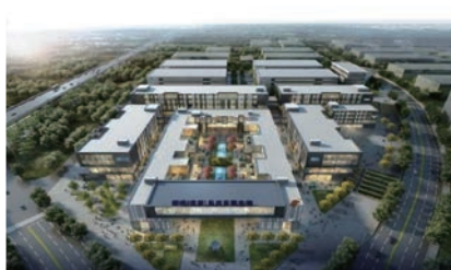
Ximei Guiyang: Under-construction metal production capacity of 1,600 tons