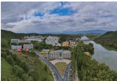
Ximei Guangdong: Oxide production capacity of 2,000 tons

Core production bases of the Group up to the date of this report: