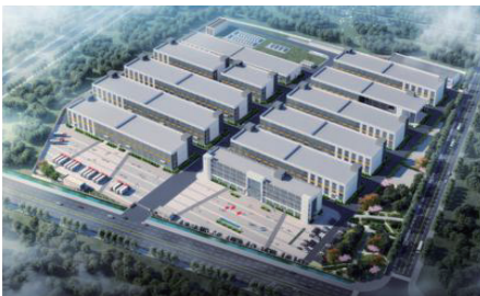
Ximei Leizhou: Under-construction oxide production capacity of 3,000 tons